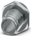
Housing screw connection, Plug, M12-Push-Pull, Front mounting, THR- und Wellenlötkontakte

Housing screw connection - SACC-FP-M-M12-THR PP - 1027679