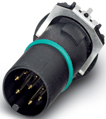
Sensor/actuator flush-type plug, 8-pos., shielded, with straight THR solder connection

Please be informed that the data shown in this PDF Document is generated from our Online Catalog. Please find the complete data in the user's documentation. Our General Terms of Use for Downloads are valid ( http://phoenixcontact.com/download )