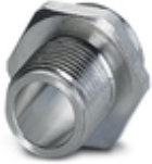
M12 pin, front mounting THR with M14 screw fastening

Housing screw connection - SACC-DSIV-M12-PLUG-9 THR - 1417984