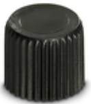
M12 sealing cap for unoccupied M12 plugs of the sensor/actuator cable, flush-type plugs and I/O devices in the field