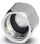
M12 metal sealing cap for unoccupied M12 plugs of the sensor/actuator cable, flush-type plugs and I/O devices in the field