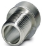
M12 pin, housing screw connection, press-in version, for all Speedcon-compatible THR and wave soldering contact carriers

Housing screw connection - SACC-M12 PLUG PRESS - 1437892