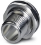
Housing screw connection, Plug, M12, Rear mounting, M15 x 1

Housing screw connection - SACC-BP-M-M12/M15-6-THR - 1413997