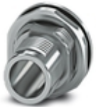
M12 SPEEDCON housing screw connection for M12 male inserts, with O-ring, for all SPEEDCON-capable THR and wave soldering contact carriers

Housing screw connection - SACC-BP-M-M12/M15-6-THR SCO - 1413999