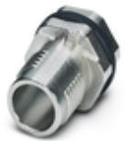
M12-SPEEDCON housing screw connection for M12 male inserts, with flat gasket, for all Speedcon-compatible THR and wave soldering contact carriers

Housing screw connection - SACC-M12-SCO PLUG L90 - 1436709