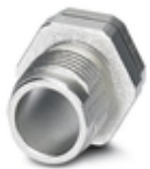
Housing screw connection with M12 standard thread, with O-ring, for the two-piece straight M12 THR contact carrier and for the two-piece angled M12 contact carrier

Housing screw connection - SACC-DSIV-M12-PLUG - 1416145