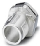
M12 SPEEDCON housing screw connection for M12 male inserts, with O-ring, for all SPEEDCON-capable THR and wave soldering contact carriers

Housing screw connection - SACC-M12-SCO PLUG - 1551493